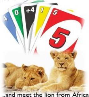
...and meet the lion from Africa